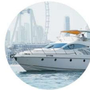
AZIMUT 50 GRAND CREW