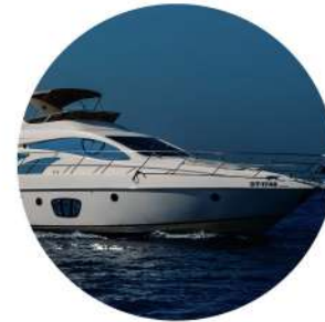
AZIMUT 55 YES