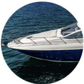
AZIMUT 48 NO REGRETS