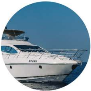
AZIMUT 55 8ofUS