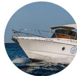
KEY LARGO 30