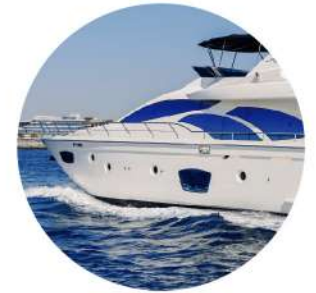
AZIMUT 75 VIKTORIA