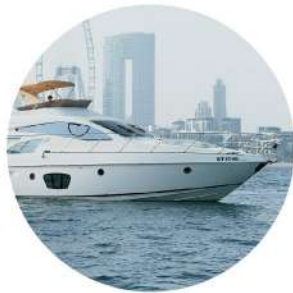
AZIMUT 55 MY CHOICE