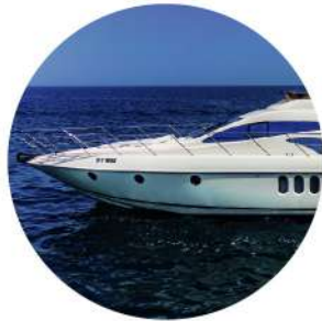
AZIMUT 62 LUCKY STAR