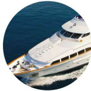
BENETTI 115 GALLUS