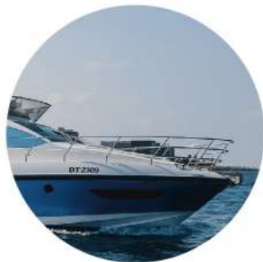
AZIMUT 45 SKY