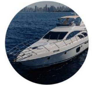
AZIMUT 55 WHITE PEARL