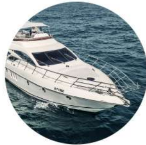
AZIMUT 62 FREEDOM