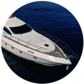
AZIMUT 68 PRINCESS