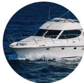
JEANNEAU 32 PRESTIGE