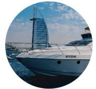
AZIMUT 50 CANDY