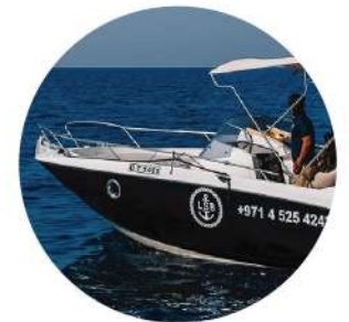
KEY LARGO 27