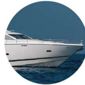
SUNSEEKER 82 WHY NOT