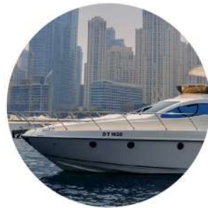
AZIMUT 50 MONICA